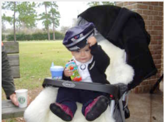
One of the young Danes enjoys the fun and good company at the Fastelavns Party in Hermann park.

For those not familiar with Danish traditions, we can assure you that the barrels are filled with fruit and candy, although according to history, in the good ole days a living cat would be hidden in the barrel, and the poor animal would be scared to death and run for it's life, when somebody finally broke the barrel.